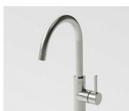
Brushed Nickel (PVD)