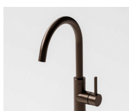
Brushed Bronze (PVD)