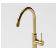
Brushed Brass (PVD)