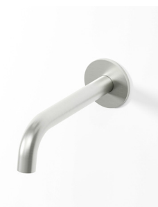
Brushed Nickel (PVD)