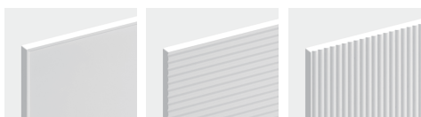
Axel Orchard Pillar