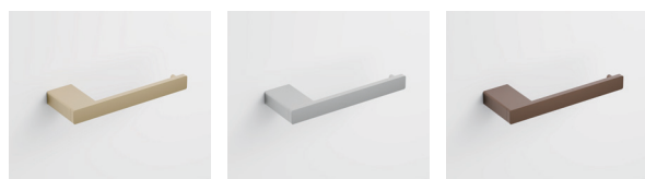
Brushed Brass (PVD)