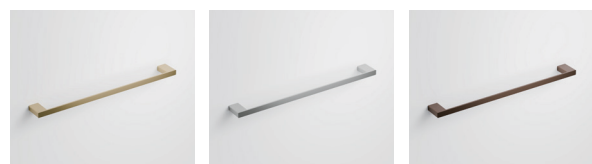
Brushed Brass (PVD)