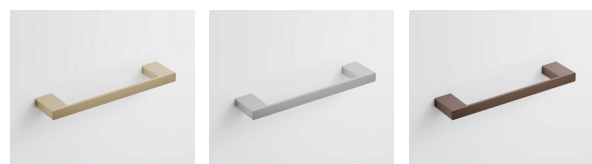
Brushed Brass (PVD)