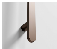
Brushed Bronze (PVD)