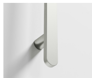
Brushed Nickel (PVD)