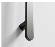
Gun Metal (PVD)