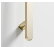
Brushed Brass (PVD)