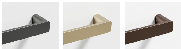
Gun Metal (PVD)