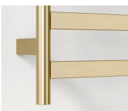
Brushed Brass (PVD)