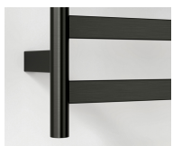
Gun Metal (PVD)