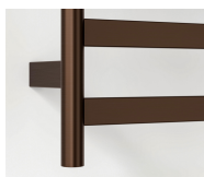
Brushed Bronze (PVD)