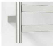
Brushed Nickel (PVD)