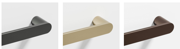
Gun Metal (PVD)