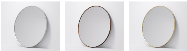
Brushed Nickel Brushed Bronze Brushed Brass