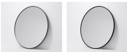
Gun Metal Matte Black