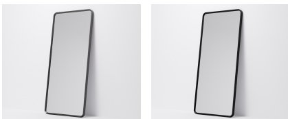
Gun Metal Matte Black