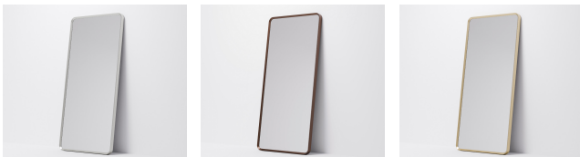
Brushed Nickel Brushed Bronze Brushed Brass