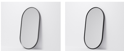
Gun Metal Matte Black