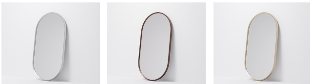
Brushed Nickel Brushed Bronze Brushed Brass