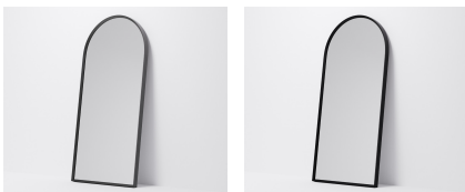
Gun Metal Matte Black