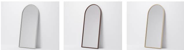
Brushed Nickel Brushed Bronze Brushed Brass